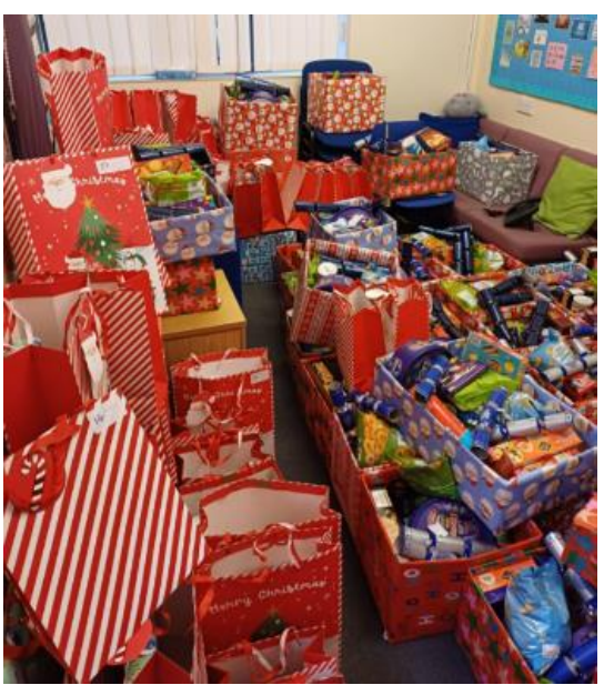
Shrewsbury Academy ወ

Our 'Something for Tea' (S4T) elves have been busy in the Christmas workshop this year, wrapping and packing the amazing donations that we have received, to festive some cheer spread amongst our community. We are extremely grateful for the donations that have been received and rest assured. this will be much appreciated by the recipients.